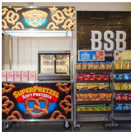
If I am hungry or thirsty I can visit the concessions area in the SE corner to buy a snack.