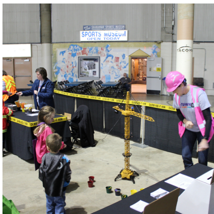
There may be other people trying out the activities. I will remember to wait my turn and stay with my group or family.