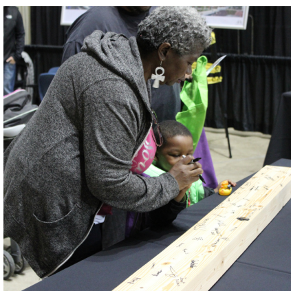
There will be lots of activities for me to try. I can even put my name on a beam for the Tacoma Dome.