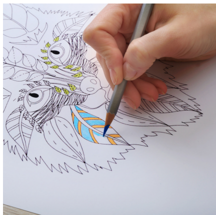
If I need a break, I can go to the quiet room for some calm activities. The quiet room is in the hallway by the doors to the Exhibition Hall.