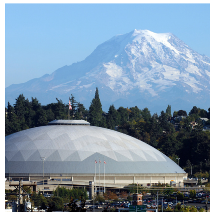
I had a great day at Tacoma Dome. Knowing what to expect made it fun and easy. I can't wait to go back!